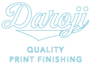
Vector PDF in Outline View

Word, Powerpoint, JPEG, PSD, Multipage PDF that Acrobat has saved as images and not Vector.